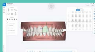
Web-based Treatment Planning