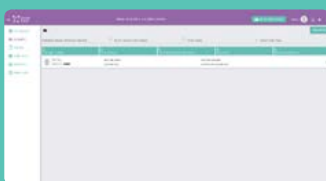
Case Management Portal

Choose to manufacture in-house or outsource to third-party manufacturers. Direct 3D printer integration and automatic nesting for leading 3D printers.