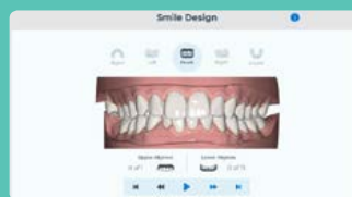
Patient Viewer Tool