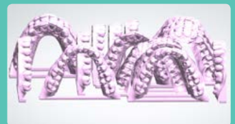
3D Printer Integration with automatic nesting